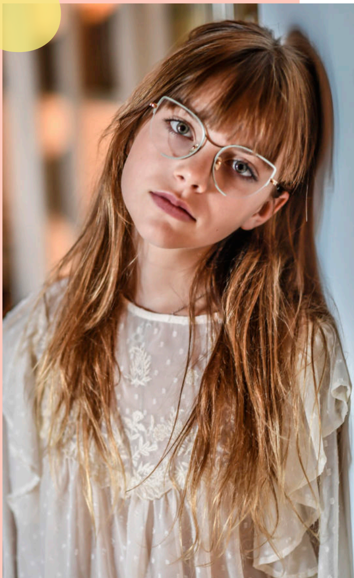
Model ARIANNE Color 232