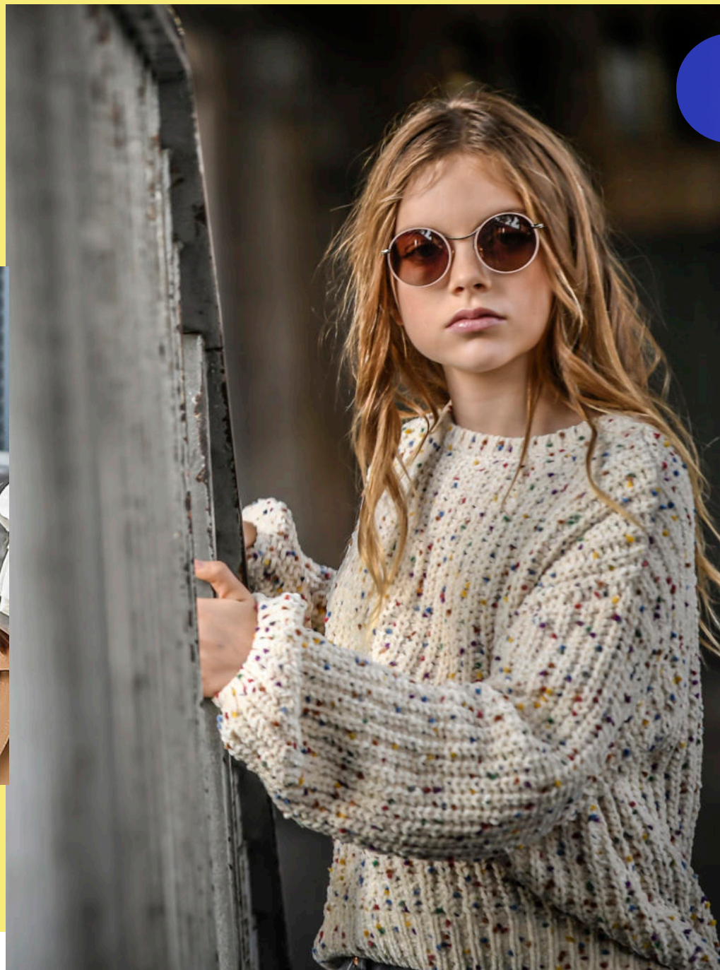
Model CHARLOTTE Color 250