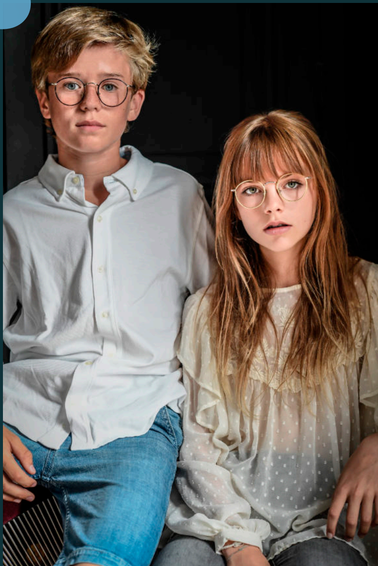
Model BRIEUC Color 269