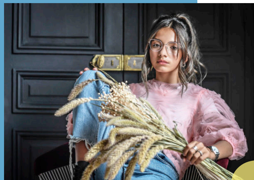
Model ARIANNE Color 250