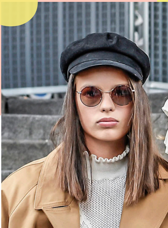
Model CHARLOTTE Color 210