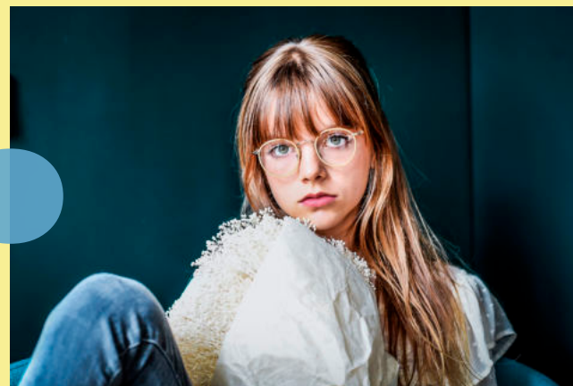
Model BRIEUC Color 268