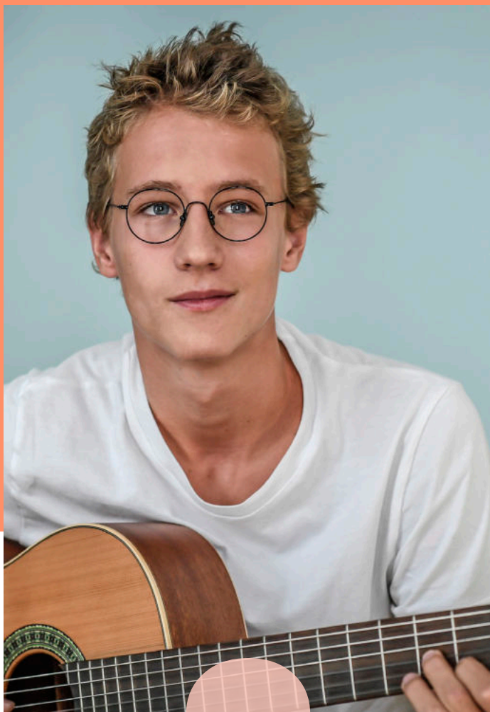
Model ULYSSE Color 248